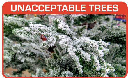
Fresh-cut holiday trees