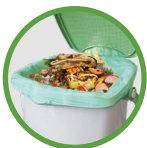
BPI Certified Compostable Bag